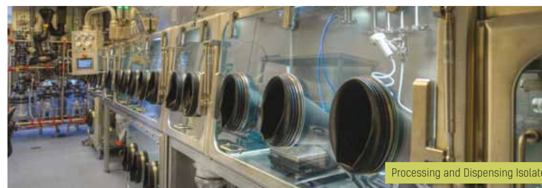
Processing and Dispensing Isolator