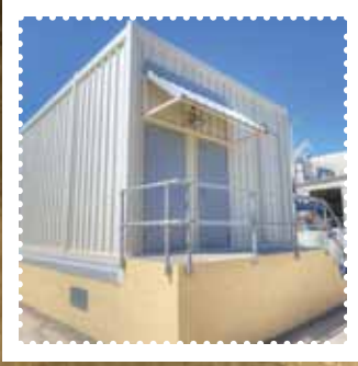
HPAPI MODULAR FACILITY

Medichem opened a new High Potency API unit, located in Hal Far (Malta) in May 2014.