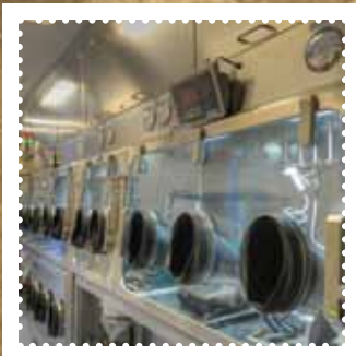
PROCESSING AND DISPENSING ISOLATOR