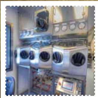
REACTOR CHARGING ISOLATOR